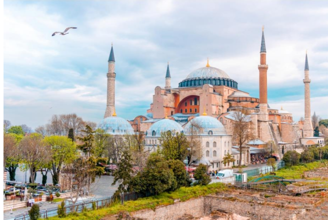
Hagia Sophia (Ayasofya)