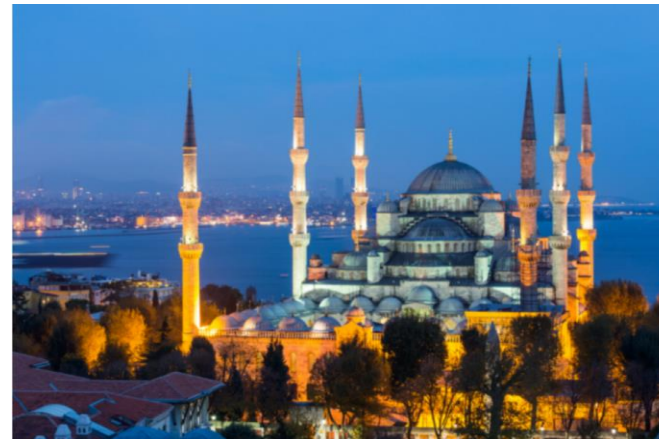
Blue Mosque (Sultanahmet)