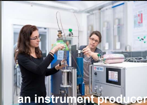
an instrument producer