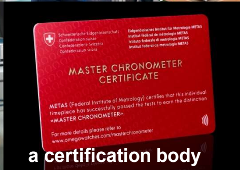
a certification body