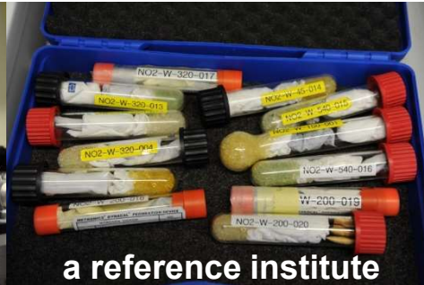
a reference institute