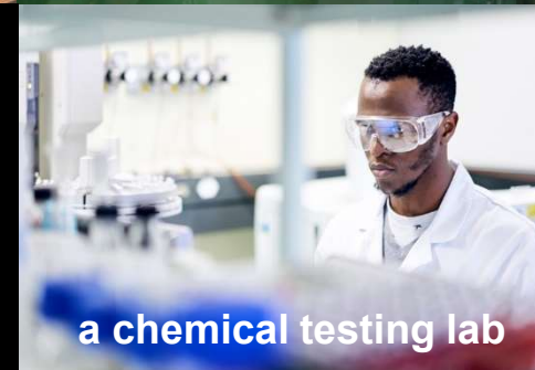
a chemical testing lab