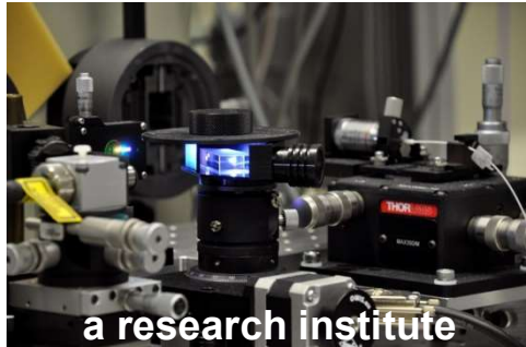
a research institute